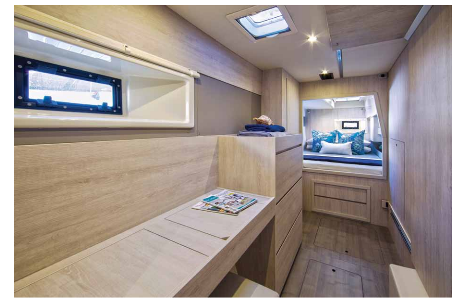
Dedicated owner's suite with an abundance of storage.

Combine all this with a softly curved brow adding to the handsome aesthetic while offering good sun