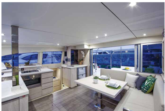
Interior saloon thru to aft cockpit.