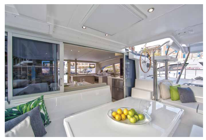
Cockpit and helmstation.