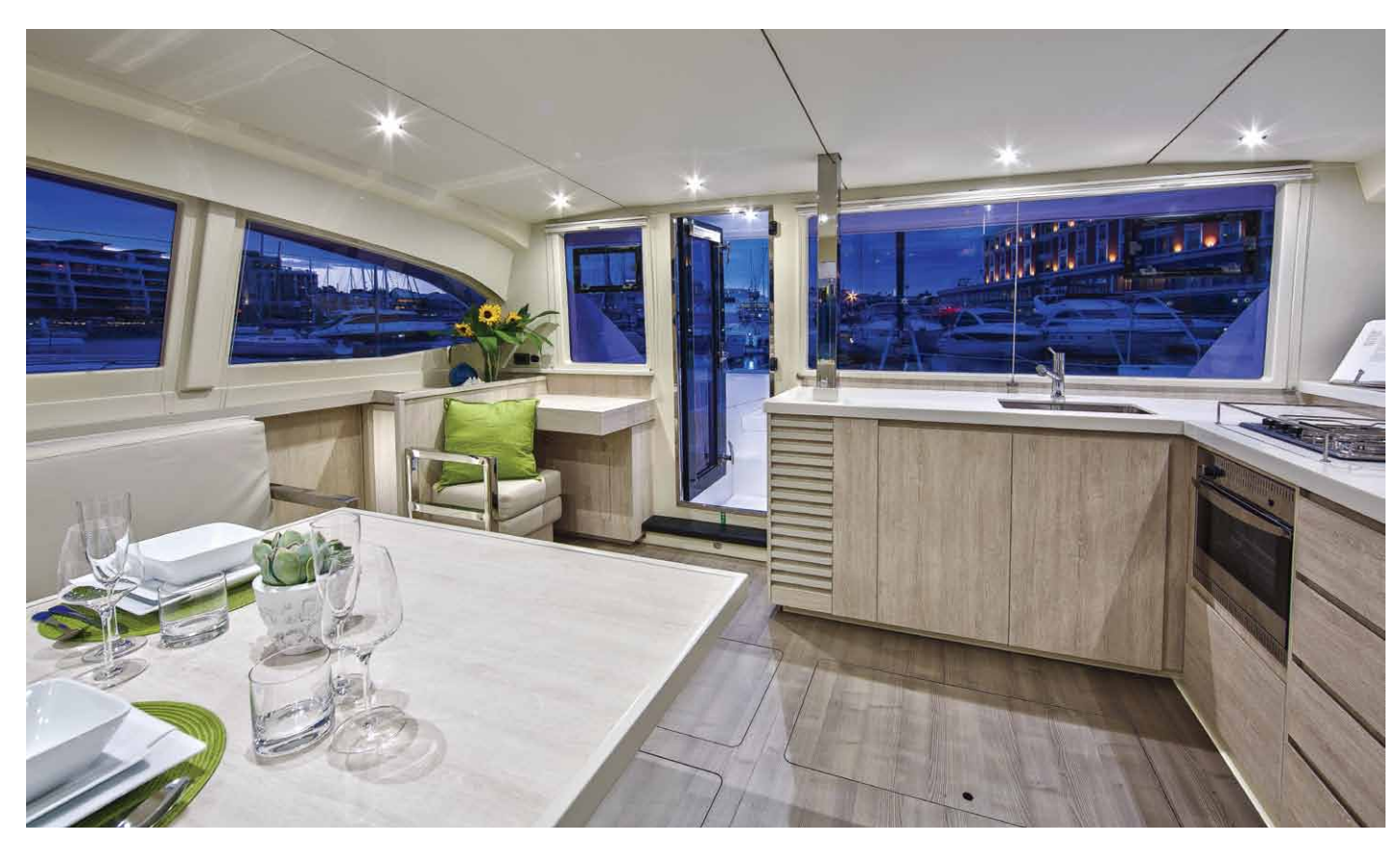
Forward facing galley and nav station.

chop and closing distances with speed over the ground around 8kts. I was reminded of just how fast this is while standing at the stern and staring hypnotically at the powerful wake as it barrelled from the back of the vessel's hulls and disappeared off into the distance.